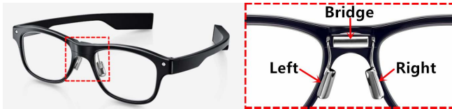
Figure 2: J!ns Meme and its EOG electrode placement.

In terms of nose interaction, people occasionally use their nose to tap the screen of a phone (e.g., to replace finger or stylus), especially when the hand is covered with a glove (during winter) or the phone is too big for one-handed usage and the non-supporting hand is occupied. The Wall Street Journal [19] reports that people also use their nose to interact with smartwatches when their hands are occupied. Most related work focuses on this idea of using the nose to interact with a touchscreen, while our work focuses on detecting the finger gesturing on the nose itself. Snout [20] explores one-handed use of touch devices using the nose, and Nose-Tapping [16] presents an in-depth user study, identifying the main challenges and contributing to the design principles for nose-based interaction.